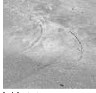
Fig. 1: Trowel pattern