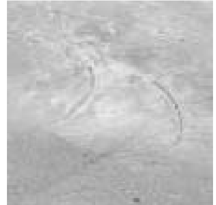
Fig. 2: Trowel marks

Trowel pattern: A concrete surface feature (Fig. 1)—produced by troweling—that can be seen but can't be felt (has no vertical profile).